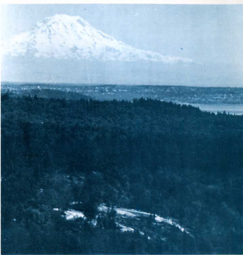
Aerial view of Mt. Rainier, with Kopachuck Ridge in foreground