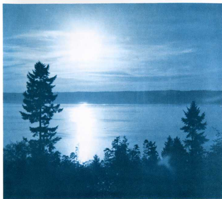
View from Kopachuck Ridge Estates