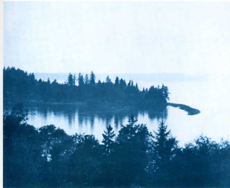
Horsehead Bay, viewed from Kopachuck Ridge